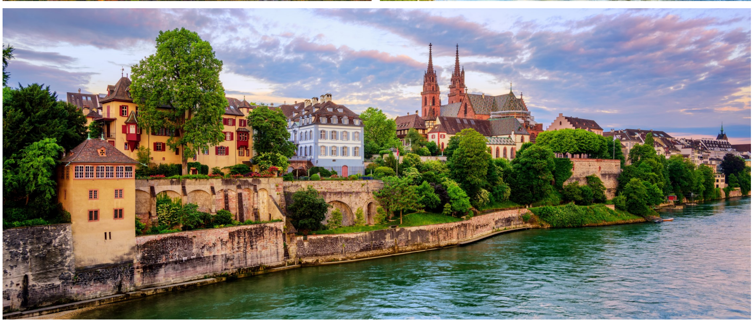
Clockwise from top left: Neuschwanstein Castle, Salzburg, Switzerland \sim Basel & Rhine River