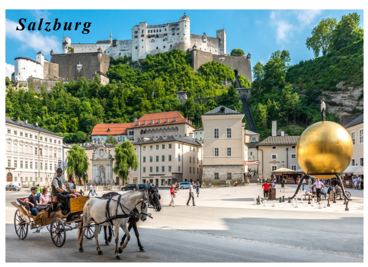
SALZBURG/OBERAMMERGAU/NEUSCHWANSTEIN/ MUNICH AREA