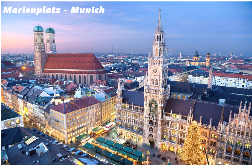
Marienplatz - Munich