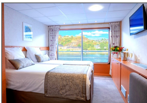
Middle Deck Stateroom