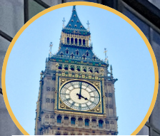
Big Ben (London)