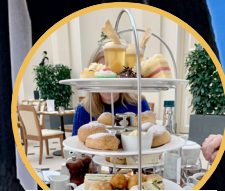
High Tea (Blenheim)