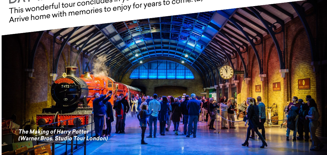
The Making of Harry Potter (Warner Bros. Studio Tour London)