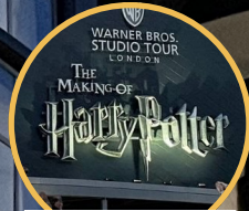
Harry Potter Tour