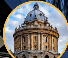
Bodleian Library (Oxford)