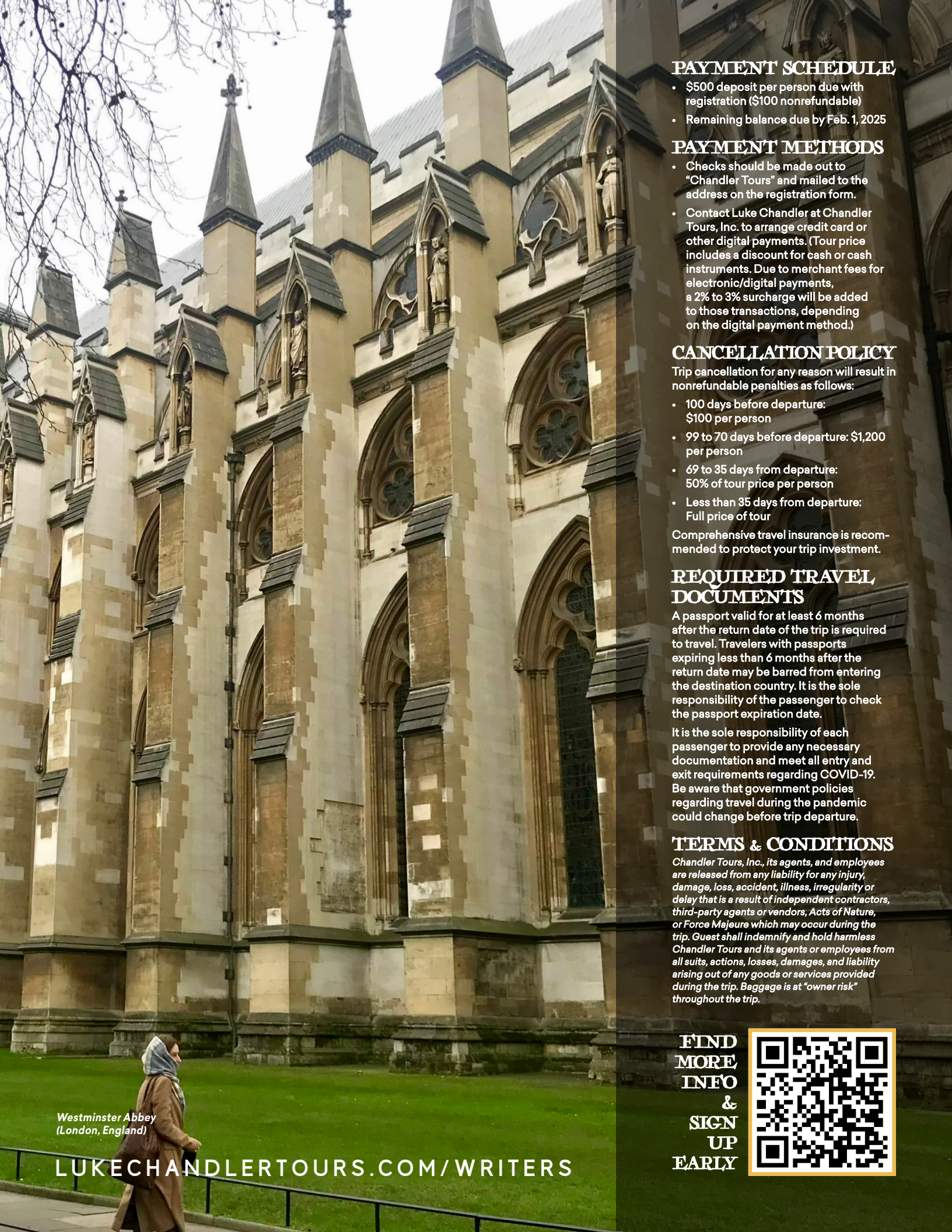
Westminster Abbey (London, England)